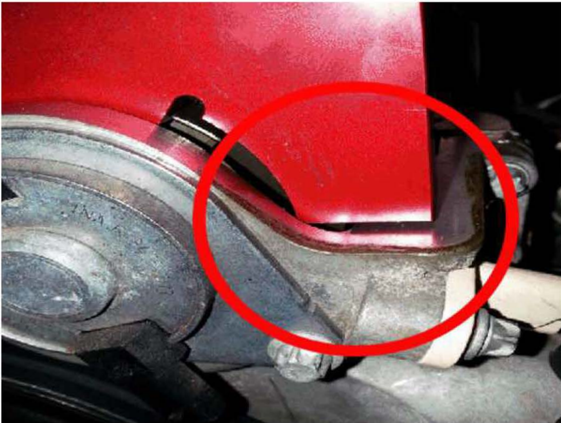
Exhaust Exciter Wheel Incorrect Alignment