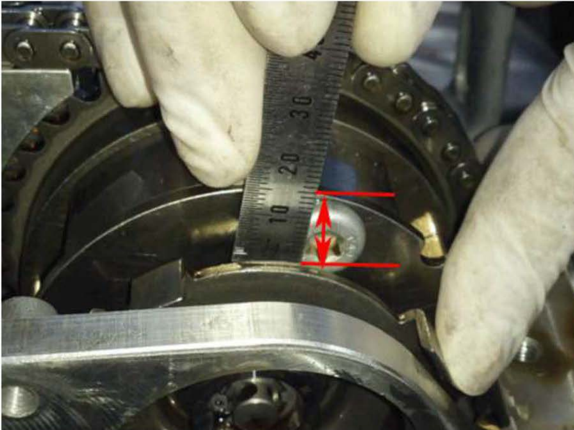
Exhaust Exciter Wheel Correct Alignment