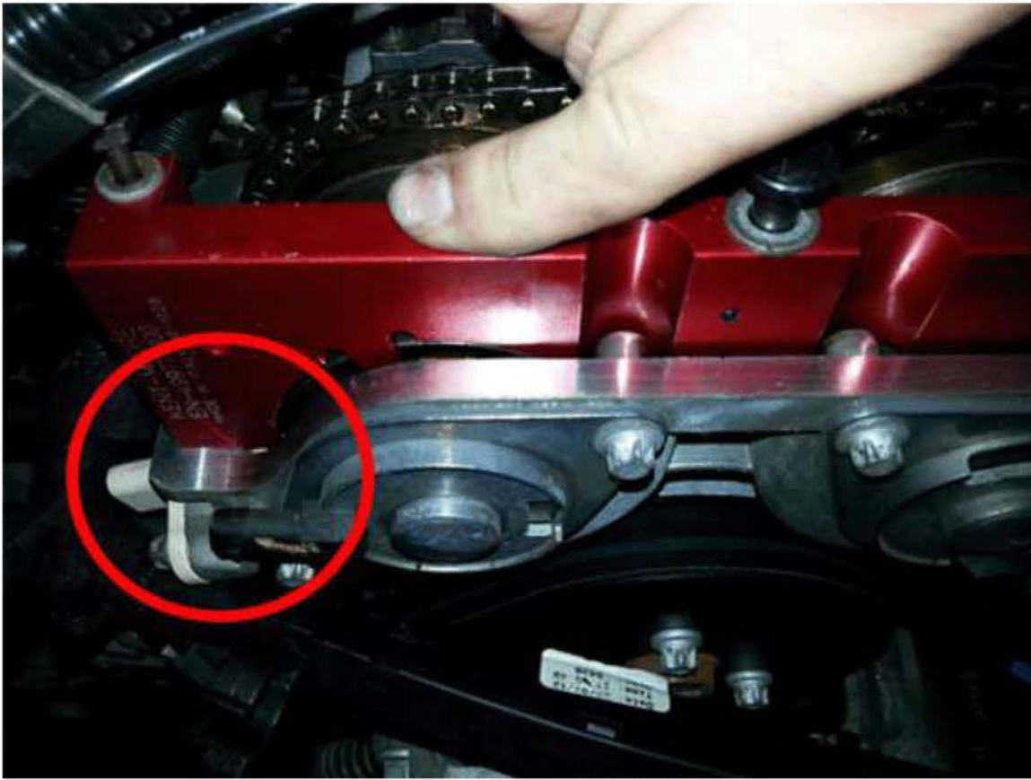
Front Cylinder Head with Tool Showing Exciter Wheel Misalignment