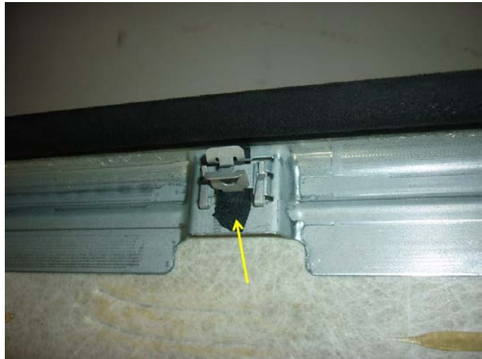
Figure 3. Clips reinstalled.