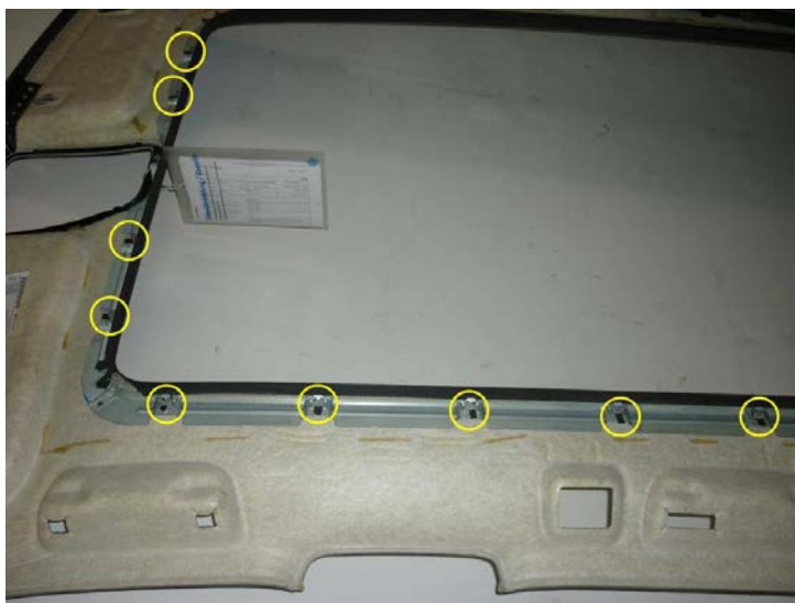
Figure 1. Location of the headliner to sunroof frame clips.