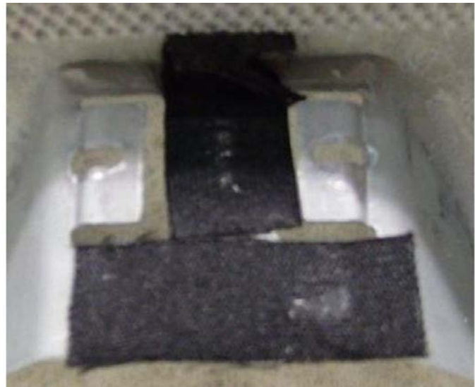
Figure 2. Location of the fleece adhesive tape application.