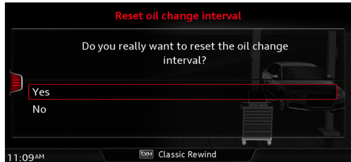
Figure 2. Confirm the oil change interval reset.

After the oil change interval has been reset, the 10,000 mile counter and the 20,000 mile counter will be displayed in the Service intervals menu (Figure 3).