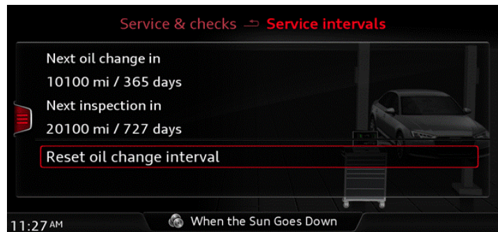
Figure 3. 10,000 mile counter and 20,000 mile counter displayed in the Service intervals menu of the MIB.