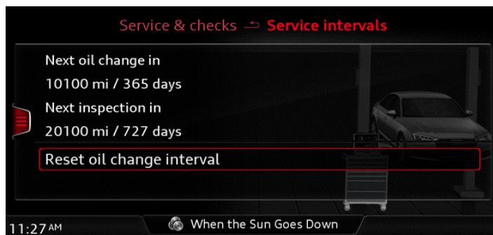
Figure 3. 10,000 mile counter and 20,000 mile counter displayed in the Service intervals menu of the MIB.