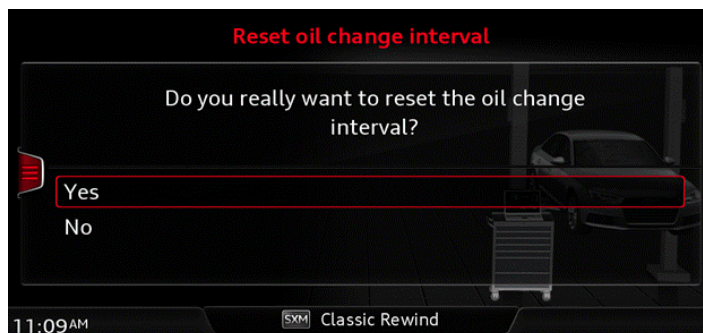
Figure 2. Confirm the oil change interval reset.

After the oil change interval has been reset, the 10,000 mile counter and the 20,000 mile counter will be displayed in the Service intervals menu (Figure 3).