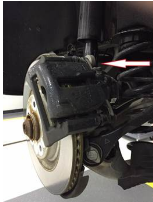
Figure 3. Balance weight position.

For vehicles that require balance weight (3.0 TFSI and TDI): The balance weight should be assembled in the upper position near the parking brake electric motor connector (Figure 3).