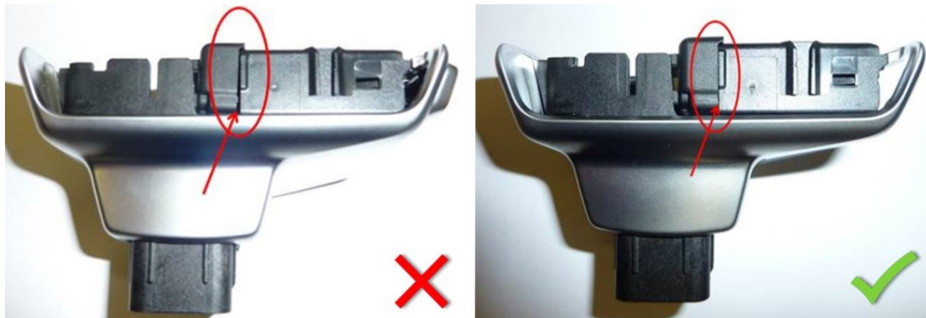
Figure 1. Incorrectly-installed (left) and correctly-installed (right) cover.