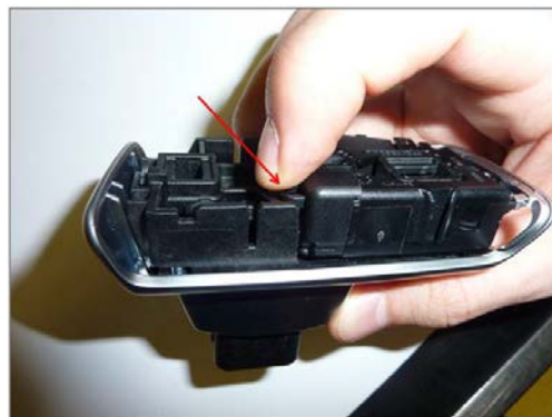
Figure 2. Apply force to fully install the cover.