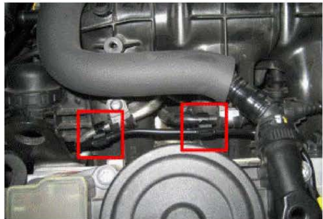
Figure 2. Routing of fresh air line.

When routing the clean air line to the intake manifold flap valve, ensure that the clean air line is routed between the cylinder head cover and the vacuum unit lever for the intake manifold flap (Figure 4).