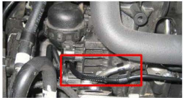
Figure 4. Routing of clean air line to intake manifold flap valve.