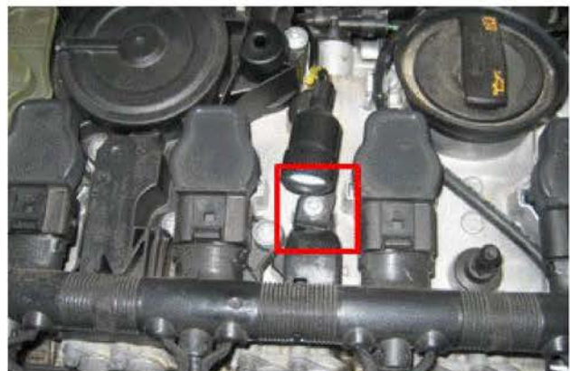
Figure 3. Securing bolt for engine wiring in in-line engine.