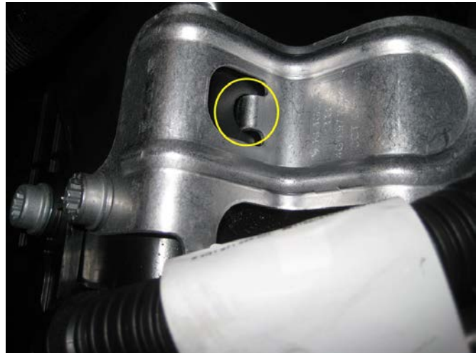
Figure 2. Locating tab before it has been wrapped with tape.

The tape should be wrapped around the tab approximately four times so that it fits firmly in the hole. There will be some resistance when the wrapped tab is put back in the hole.