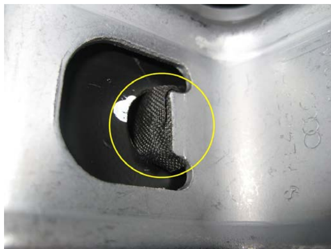
Figure 3. Locating tab after it has been wrapped with tape.