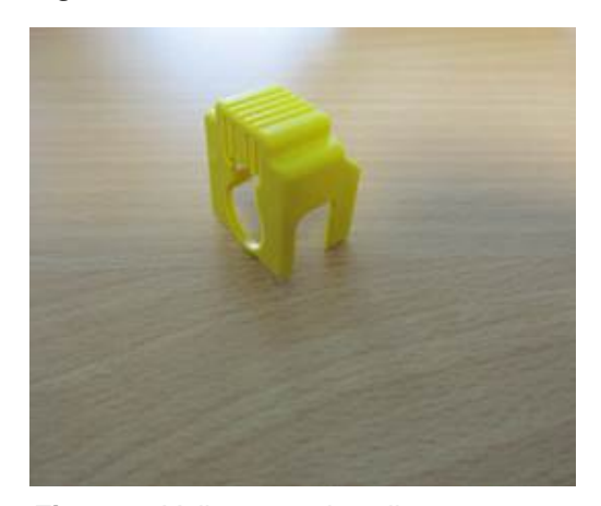
Figure 2. Yellow securing clip.

4. Install the yellow securing clip (part number 8W0201250) straight onto the black connector (Figure 2 and Figure 3). Make sure that the release tabs of the black connector are locked through the "window" of the securing clip (Figure 4).