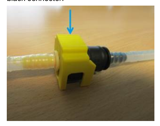
Figure 6. Push the yellow securing clip down.