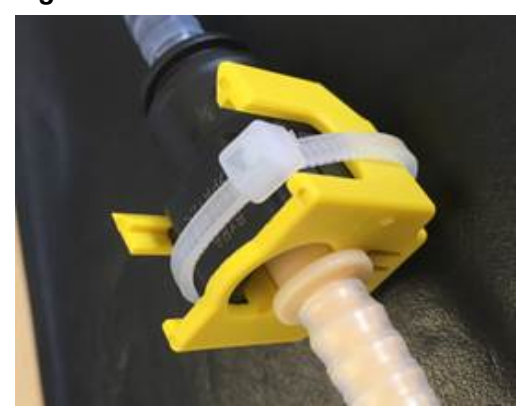
Figure 8. Cable tie installation.

7. Place the line on top of the fuel pump assembly box (Figure 9).