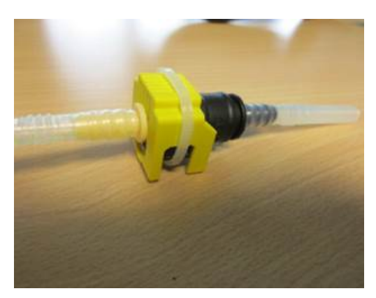
Figure 7. Cable tie installation.

6. Install a cable tie as shown (Figure 7 and Figure 8).