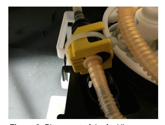
Figure 9. Placement of the fuel line.

7. Place the line on top of the fuel pump assembly box (Figure 9).