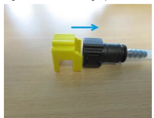
Figure 3. Installation direction of the securing clip.