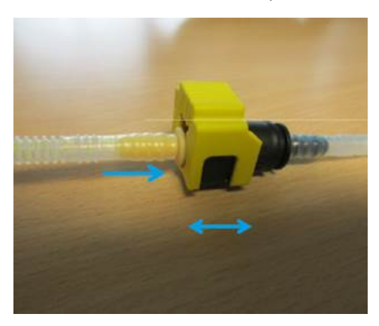
Figure 5. Insert the male end into the black connector.

5. Insert the male end of the line into the black connector, then push the yellow securing clip down (Figure 5 and Figure 6).