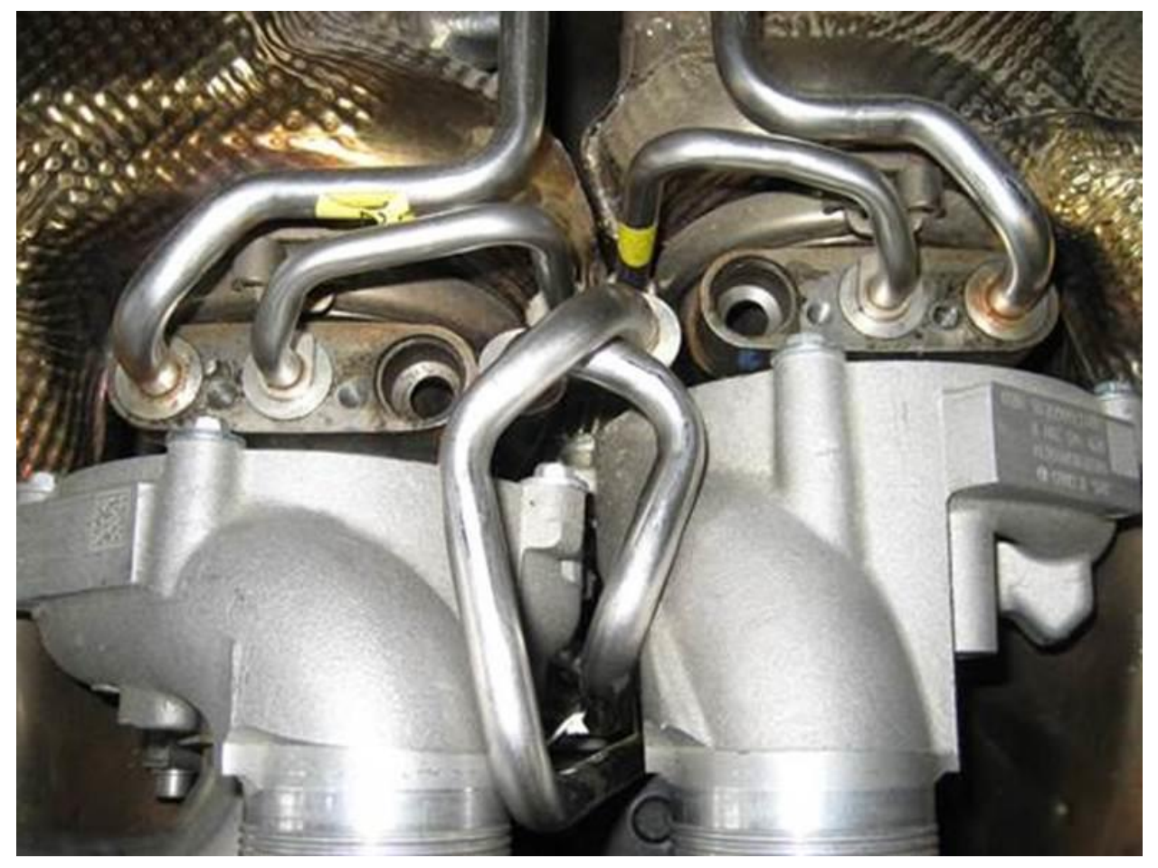
Figure 2. Recommended pipe position.