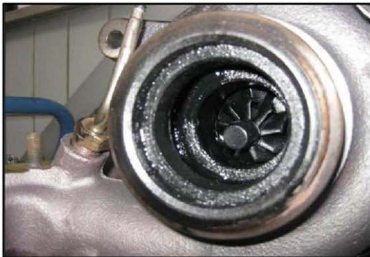
Figure 1 (broken turbocharger shaft, engine oil ingress on exhaust side)