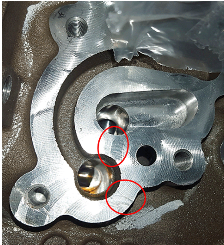
d) The oil filter adapter may have a defect leaking in the aluminum casting on an LFX engine with cartridge style filter. See picture below.