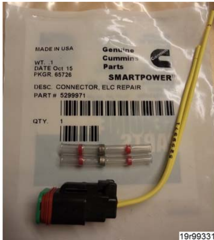
Figure 2, Electrical Connector, Part Number 5299971