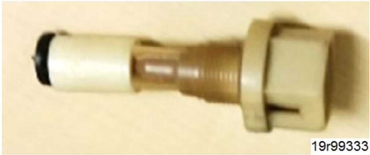
Figure 4, New Coolant Level Sensor for All Other Products and Applications, Part Number 4384190