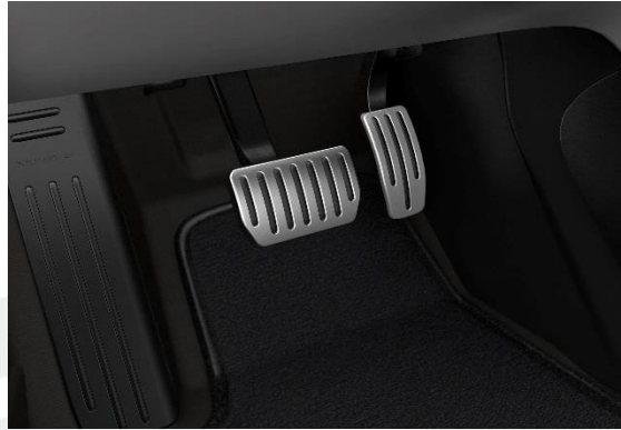
Figure 6 (LHD shown, RHD similar)