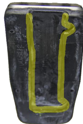
Figure 3 (Groove on accelerator pedal pads highlighted)