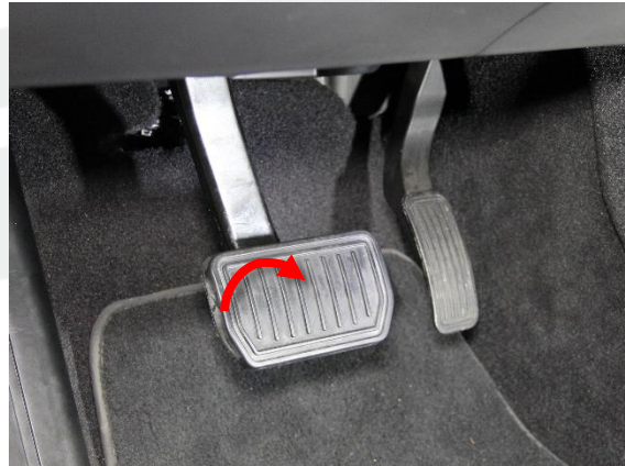
Figure 1 (LHD shown, RHD similar)