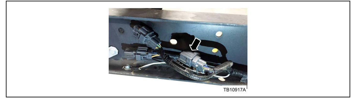
Figure 2 - Article 16-0091