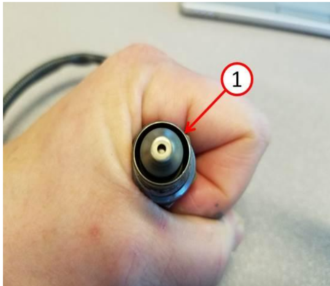
Fig. 1 Old O2 Sensor