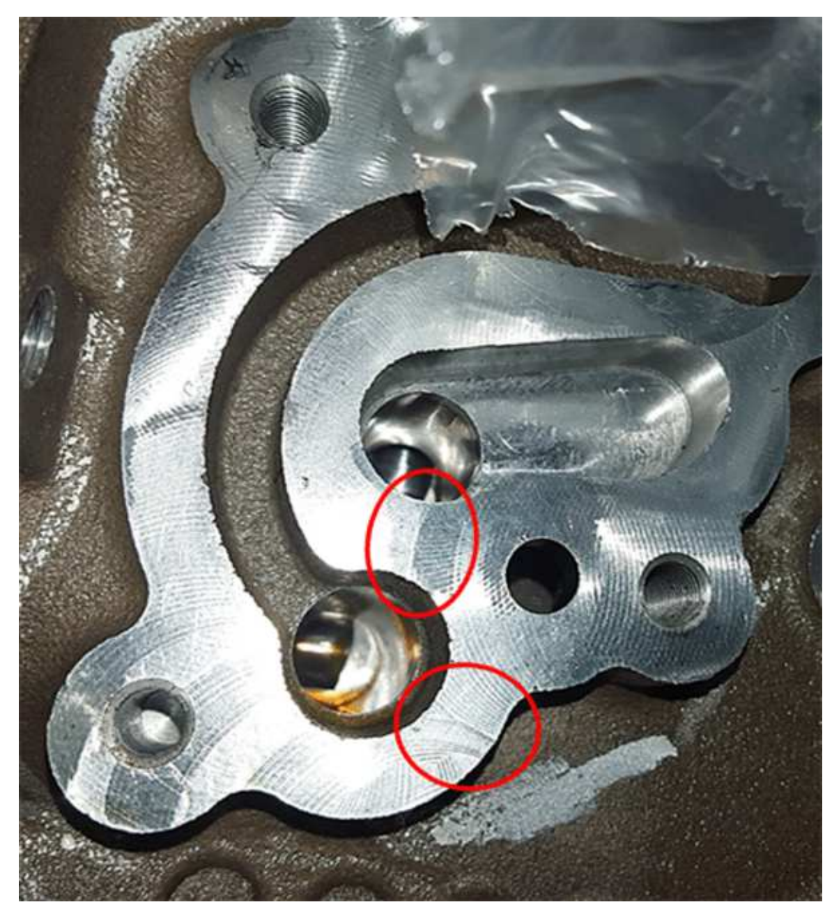
d) The oil filter adapter may have a defect leaking in the aluminum casting on an LFX engine with cartridge style filter. See picture below.