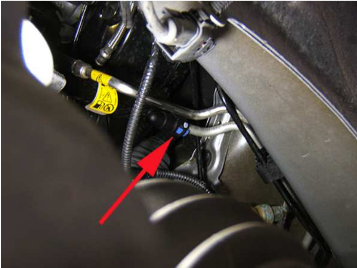
3.2. Disconnect the hose from the chassis to canister evaporative emission line.