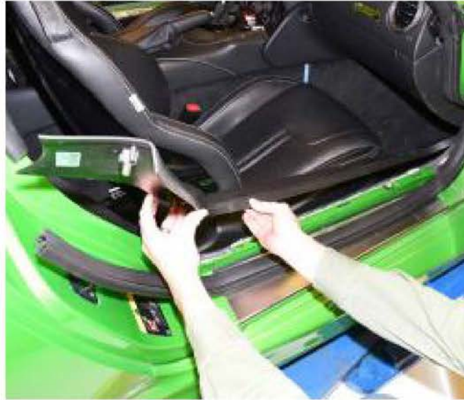
Fig. 5 Cowl Trim Piece

CAUTION: The upper and lower trim pieces are connected together and care should be taken during removal as one piece. The two pieces are bonded together and removing separately may damage trim pieces.