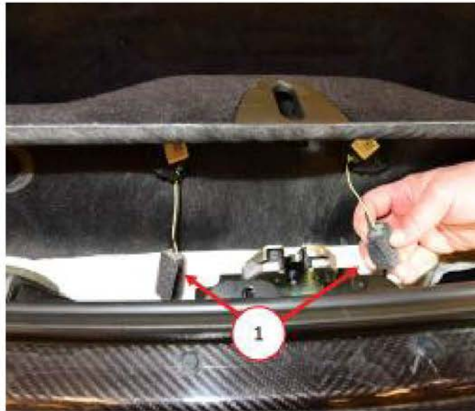
Fig. 4 Foam Tape On Electrical Connector

1 - Foam tape around cargo lamp connectors