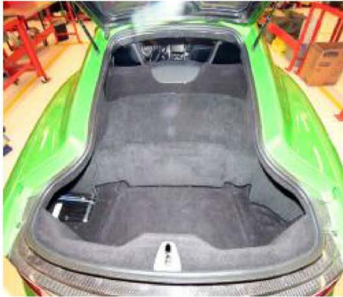
Fig. 1 View of Trunk