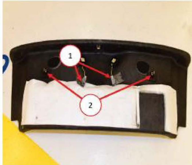
Fig. 3 Trunk Trim Panel