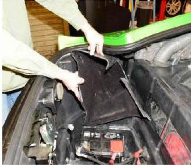
Fig. 6 Carpet Inserts

NOTE: Remove liners by bending the top portion slightly, out and away from rear tail-light assembly fasteners.