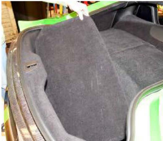
Fig. 2 Trunk Cover