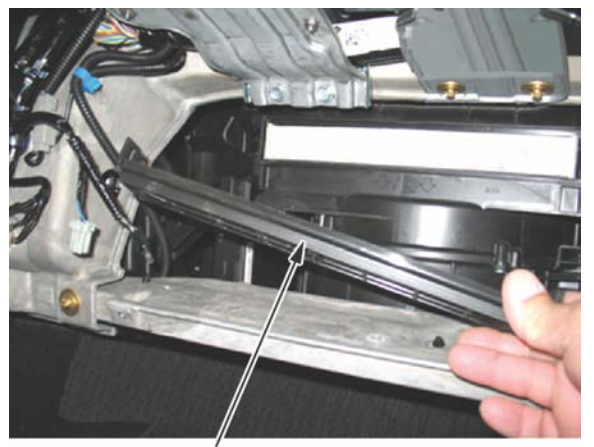
Remove HVAC filter cover.

3. Install the self-tapping screw (P/N 90132-SR3-003), into the defrost damper door shaft on the passenger side of the heater case. Start the screw by hand to minimize the chance of dropping and losing it. Tighten the screw until the head is seated against the plastic heater case.