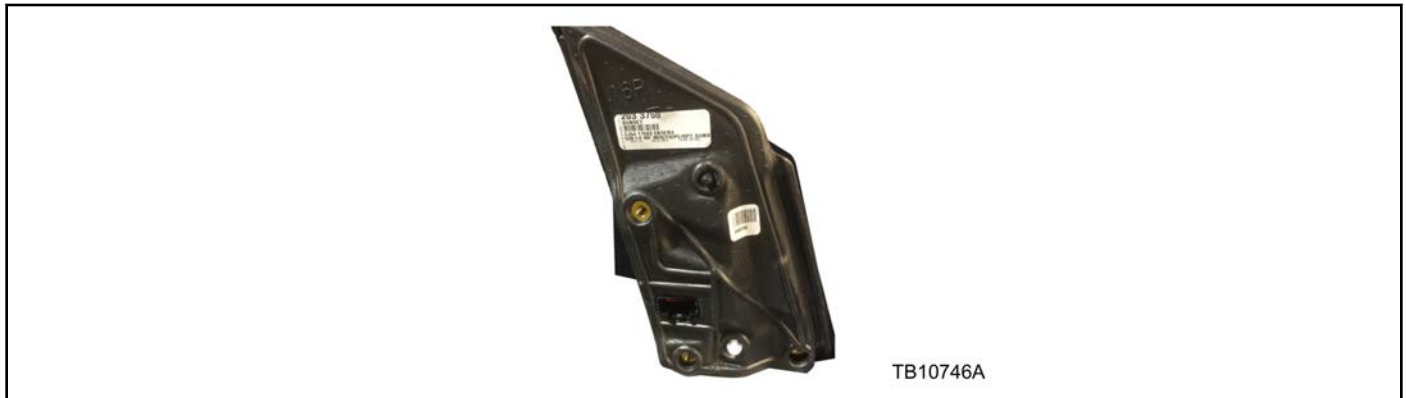
Figure 1 - Article 16-0033