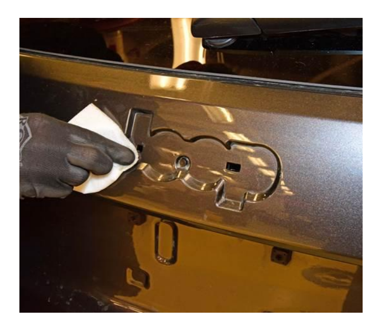
Fig. 5 Cleaning The Area