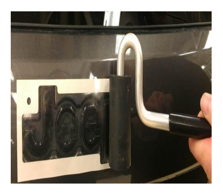
Fig. 6 Applying Pressure