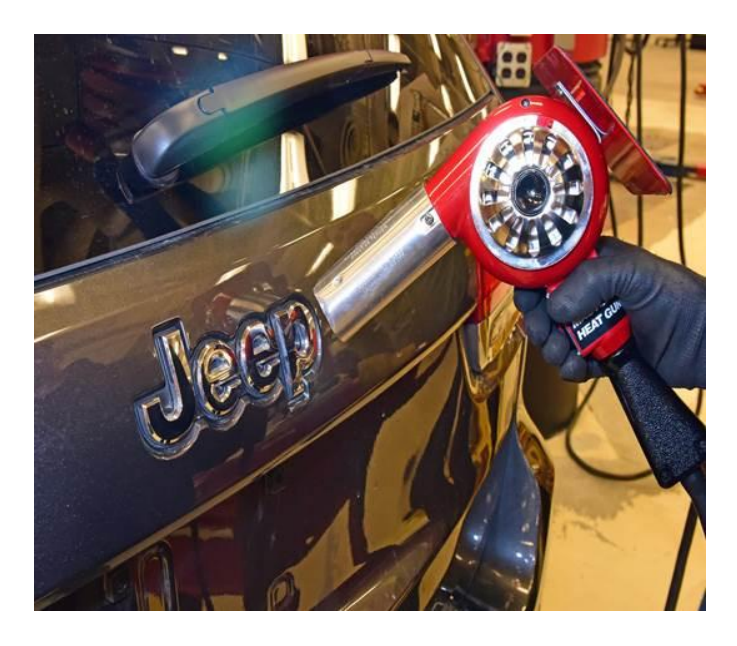
Fig. 3 Heat Gun