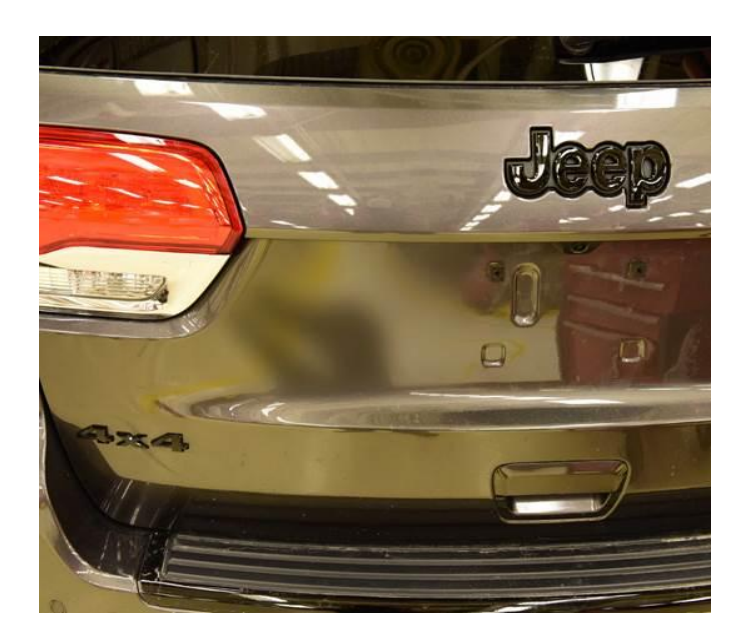
Fig. 2 Correct Emblem