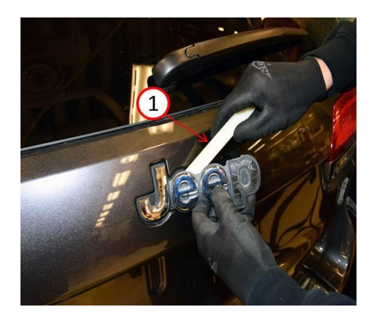
Fig. 4 Trim Stick

4. Using a trim removal tool or equivalent (Fig. 4), carefully remove the name plate or decal from the body panel, as necessary.