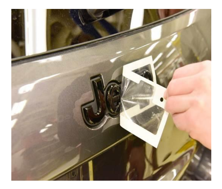
Fig. 7 Removing Protective Cover

8. Remove the protective covering from the name plate (Fig. 7).