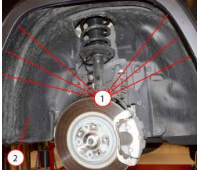
Fig. 2 Inner Fender Well