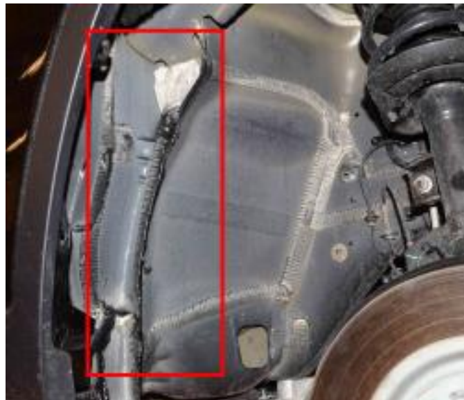
Fig. 3 Body Sealer Leak Area