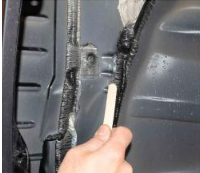
Fig. 5 Smooth Sealer With Wood Stick