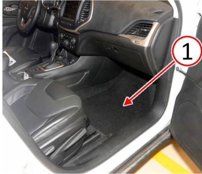
Fig. 1 Water in Front Footwell

The customer may describe damp or wet carpet in the front footwell or in the rocker sill. This condition is primarily found on the left side but may be on the right (Fig. 1) or both footwells. The cause of this leak may be due to a sealant void on the body seam, allowing water to enter the vehicle interior.