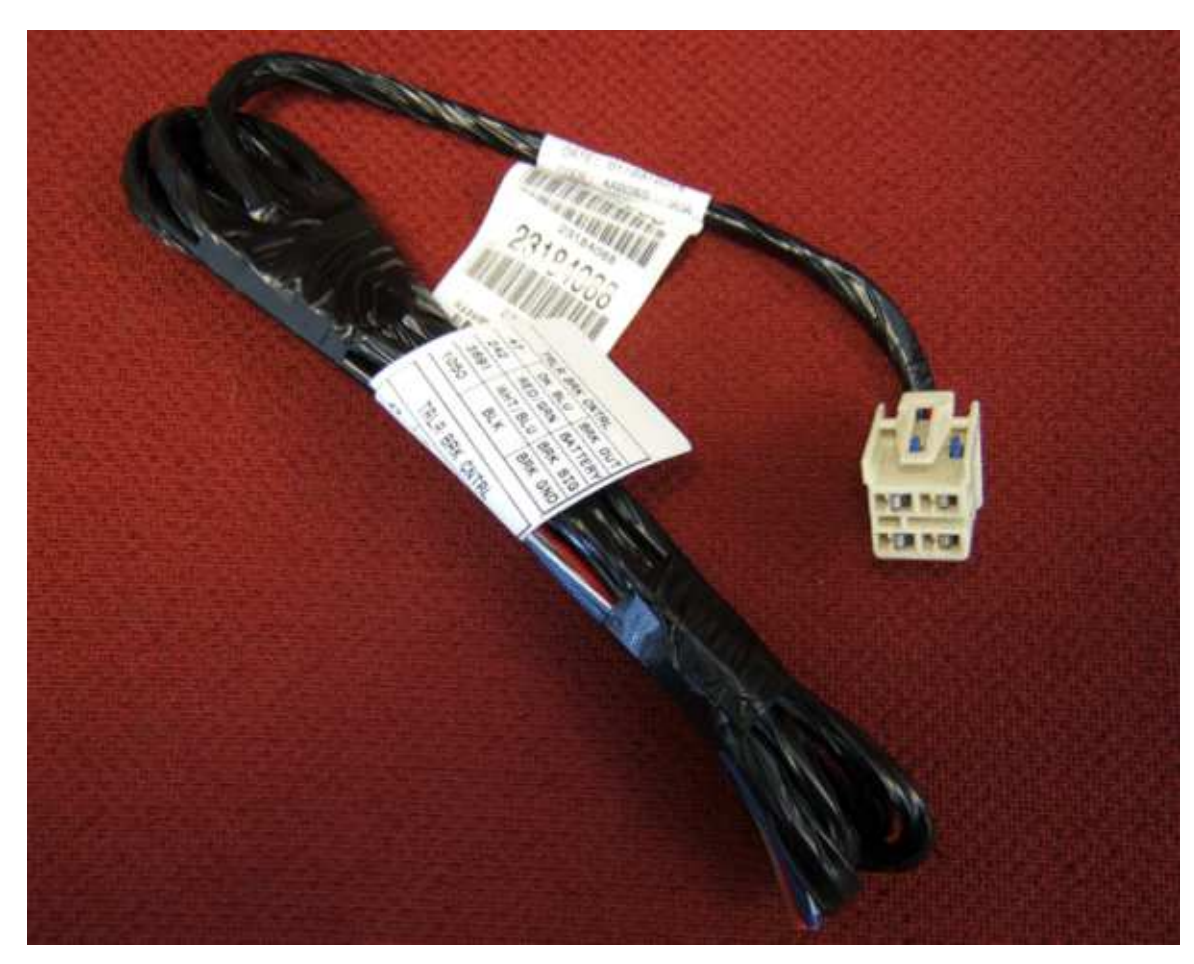
Connect the harness to the MID-BEC (X61A). The MID-BEC is located under the I/P to the left of the steering column. The harness connection point (1) is illustrated below.