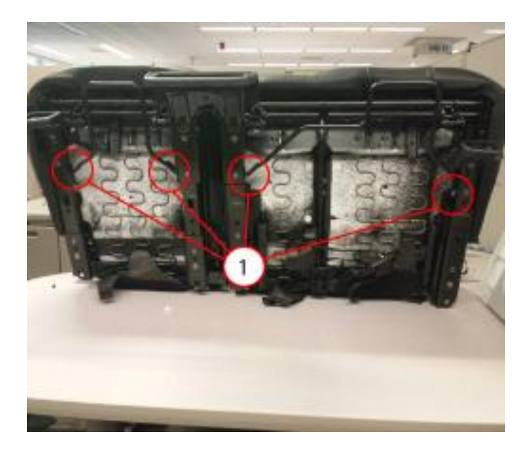
Fig. 1 Speed Nut locations

1. If the customer describes symptom/condition, verify by driving the vehicle over roads of varying quality and surface types. firmly hold the seat track adjuster bar and listen for a rattle/tick around one or more of the seat track adjuster bar to track connection areas (Fig. 1).