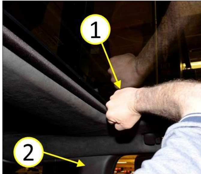
Fig. 1 Push And Tap On Sunroof Glass Panel