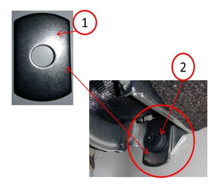
Fig. 2 Additional Washer To Add