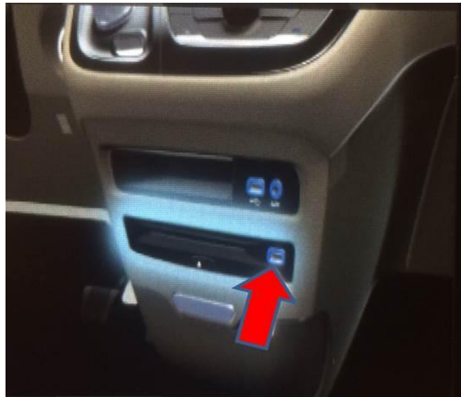
Fig. 1 USB Port