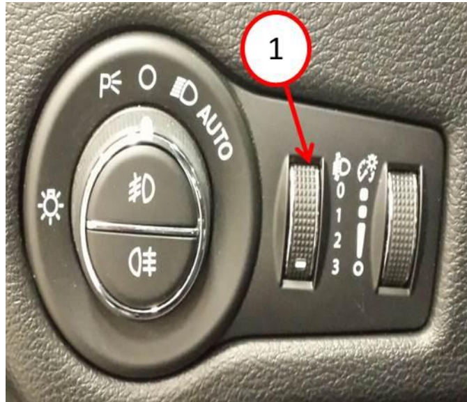
Fig. 1 Headlamp Leveling Switch

Customers may describe that the headlamp leveling switch positions are opposite of the actual headlamp positions (Fig. 1). For example, switch down position is headlamps up and vice versa.