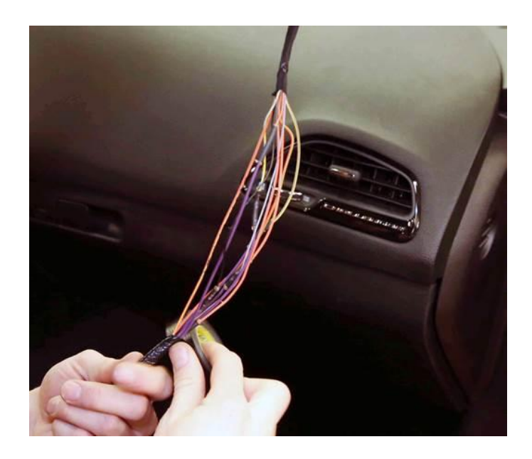
Fig. 6 Tape Wiring