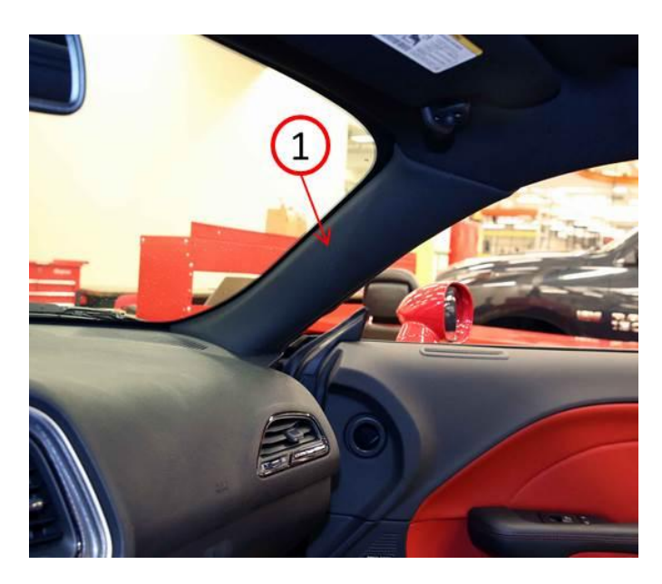
Fig. 1 A Pillar Cover

1. Remove the passenger A-Pillar trim piece (Fig. 1). Refer to the detailed service procedures available in DealerCONNECT> TechCONNECT under: 23 - Body/Interior/Panel, A-Pillar Trim/Removal.