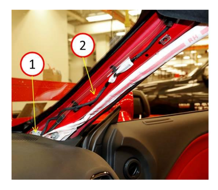
Fig. 2 Electrical Connector

2. Locate the sunroof circuit wiring connector. Examine the harness running up the A Pillar. If the harness is tight or stretched (causing connector stress), it may be pulling on the connector pins causing an intermittent connection. The figure shown shows a good wire harness with proper length (Fig. 2).