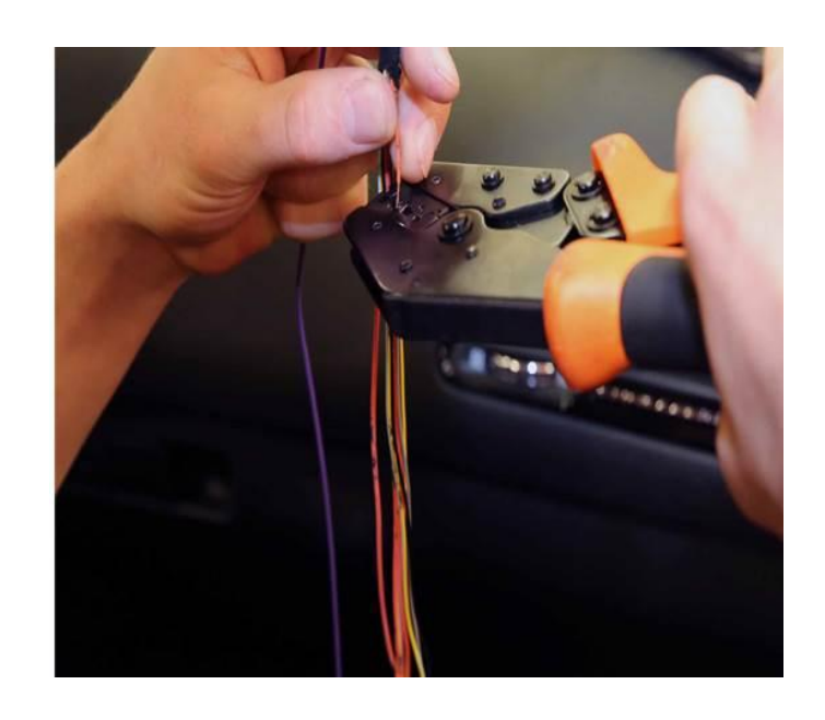
Fig. 4 Crimpers