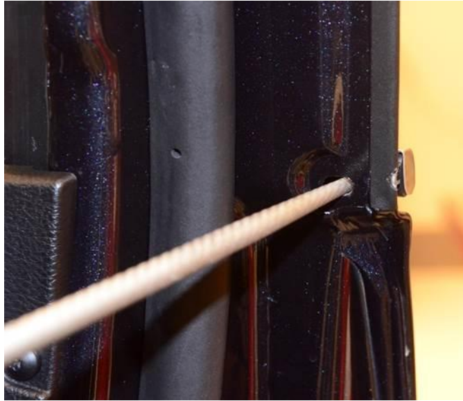
Fig. 4 File Area