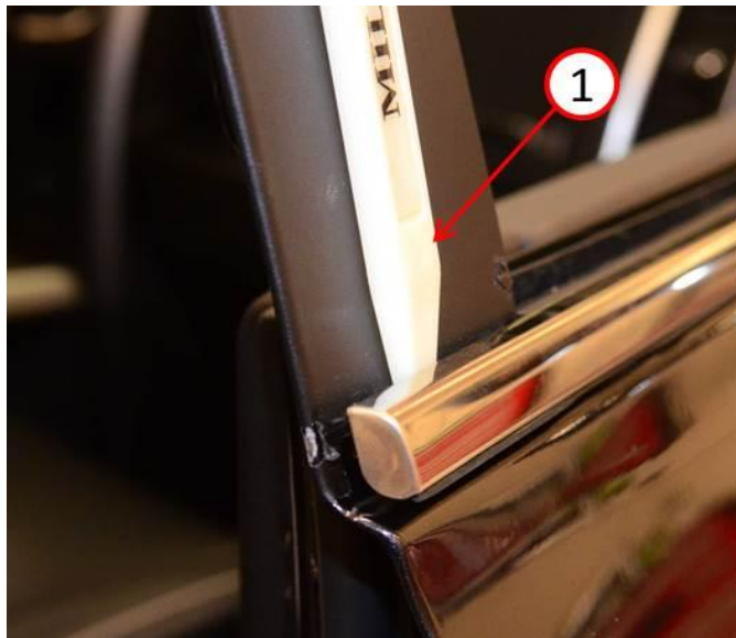
Fig. 3 Trim Stick