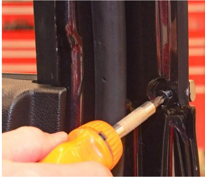
Fig. 2 Screw Securing Belt Molding