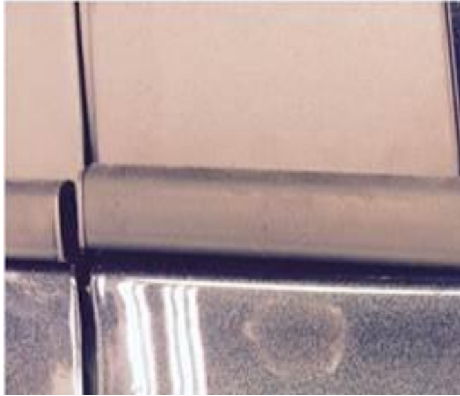
Fig. 1 Outer Belt Molding Difference

If a customer's VIN is listed in VIP or your RRT VIN list, perform the repair. For all other customers that describe the symptom/condition listed above, perform the Repair Procedure.