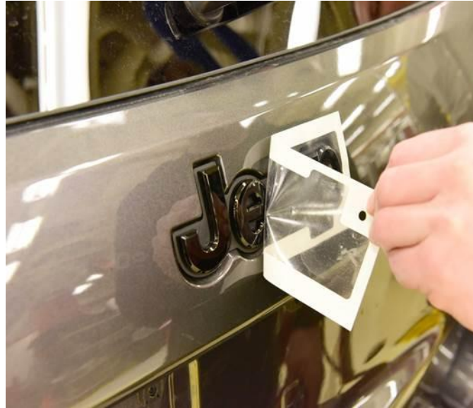
Fig. 7 Removing Protective Cover