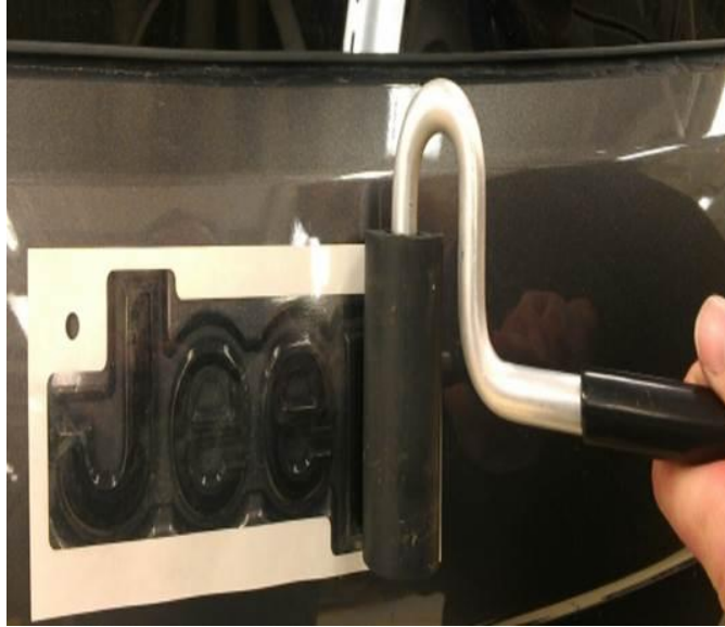
Fig. 6 Applying Pressure

NOTE: To ensure proper name plate or decal adhesion, apply consistent and uniform pressure of approximately 40 p.s.i. over the entire surface of each name plate or decal (Fig. 6).