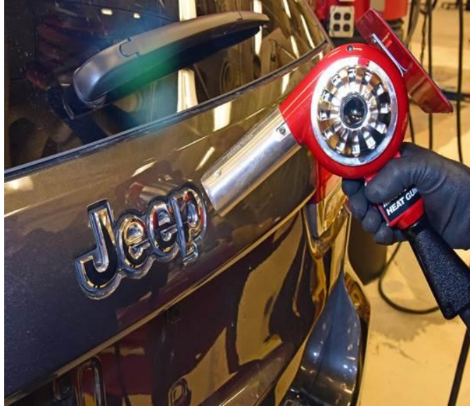
Fig. 3 Heat Gun