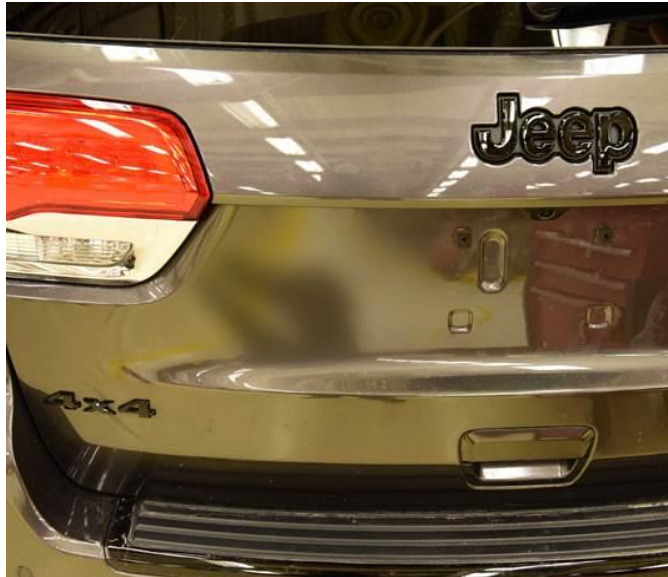
Fig. 2 Correct Emblem