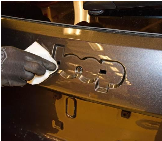
Fig. 5 Cleaning The Area