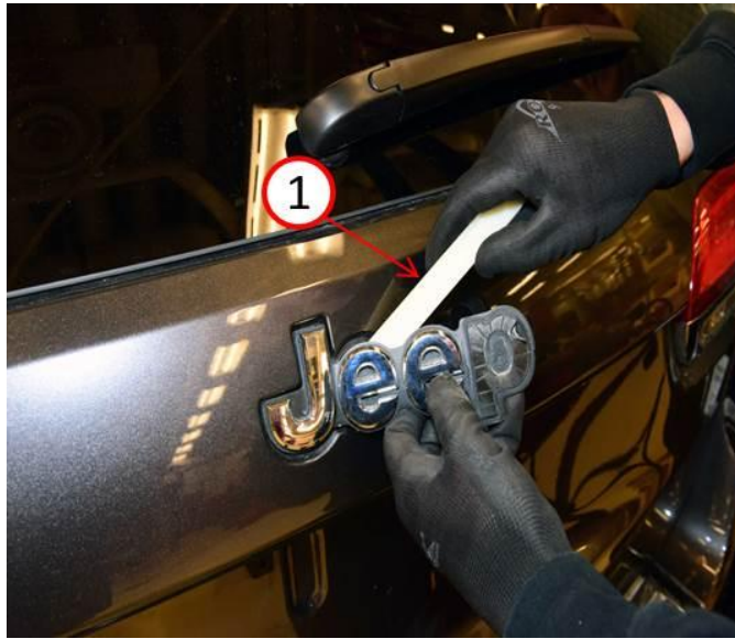
Fig. 4 Trim Stick