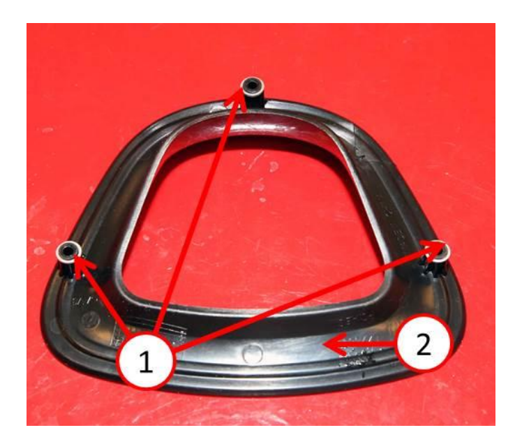
Fig. 2 Install New Wheel Inserts

3. Locate the spacers on the wheel base holes where the inserts were installed. Replace with new spacers (15 washers; three for each of the five inserts per wheel) (Fig. 2).