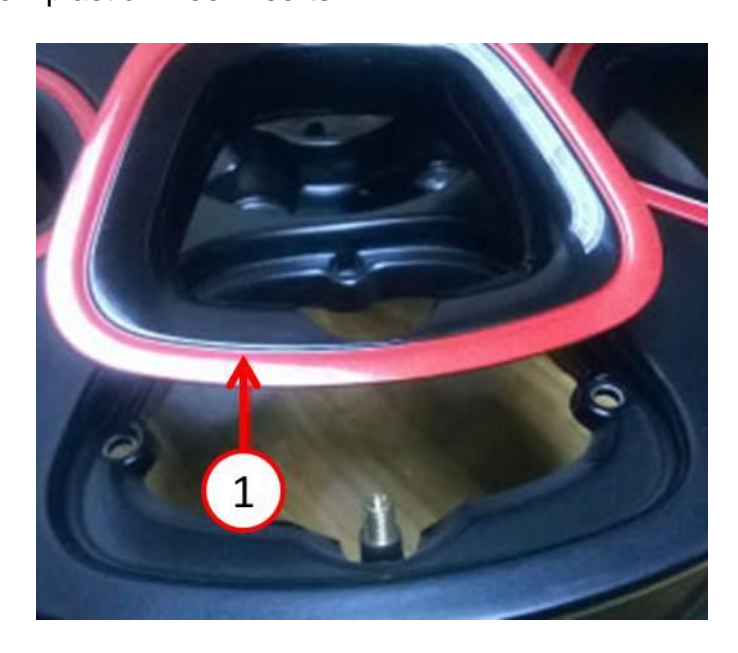
Fig. 3 Place insert onto front of wheel