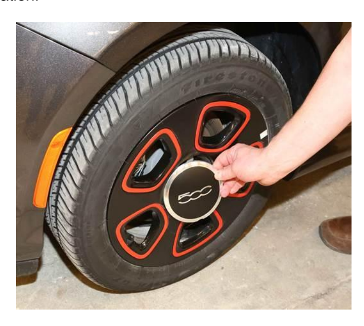
Fig. 5 Completed wheel

6. Install the wheels on the vehicle (Fig. 5). Refer to the detailed service procedures available in DealerCONNECT> TechCONNECT under: Service Info> 22 - Tires and Wheels> Installation.