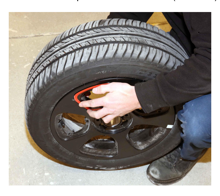
Fig. 4 Install New Wheel Inserts

5. Tighten the insert screws to a torque of 2.0 +/- 0.1 N·m. (18 in·Lbs) (Fig. 4).