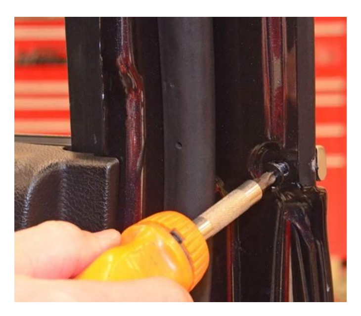
Fig. 2 Screw Securing Belt Molding

1. Remove the outer belt molding retaining screw(Fig. 2).