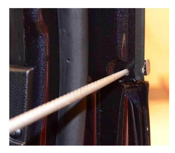
Fig. 4 File Area

4. Use a file to open up the bottom of slot for the screw hole on the door (Fig. 4). The final height of the slot should be around 8mm (0.315 in). Do not exceed 10mm (0.4 in) slot height (Fig. 5). Be careful not to damage the surface or molding with the file.