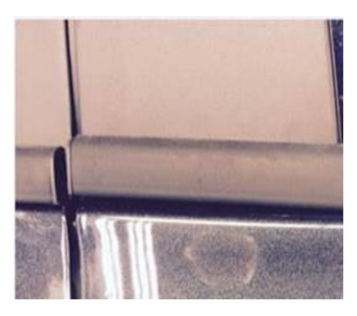
Fig. 1 Outer Belt Molding Difference

If a customer's VIN is listed in VIP or your RRT VIN list, perform the repair. For all other customers that describe the symptom/condition listed above, perform the Repair Procedure.