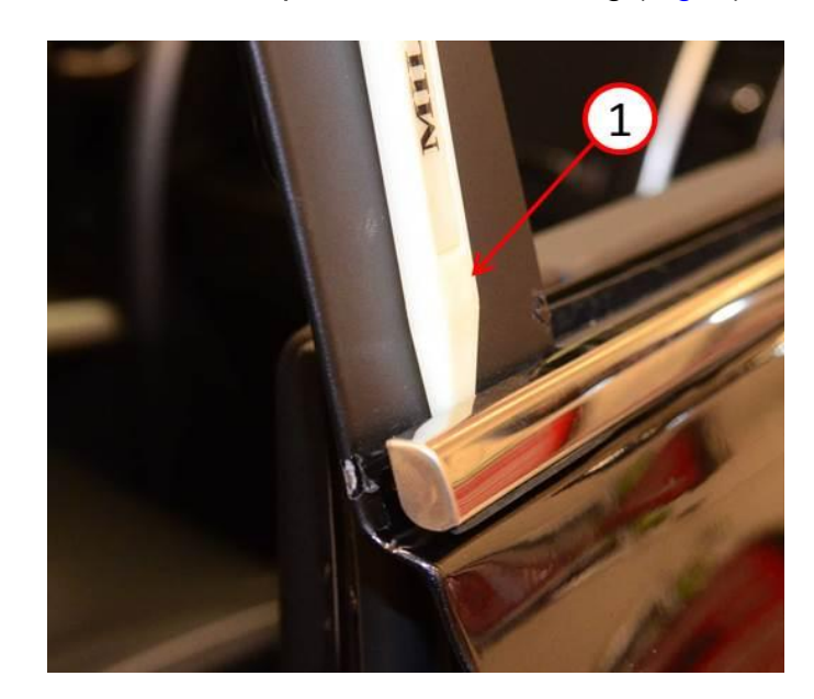
Fig. 3 Trim Stick

3. Insert a trim stick between the B pillar and belt molding (Fig. 3).