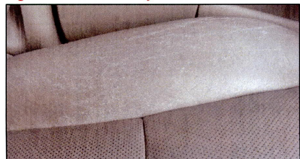
Figure 3. Wear caused by outside influence