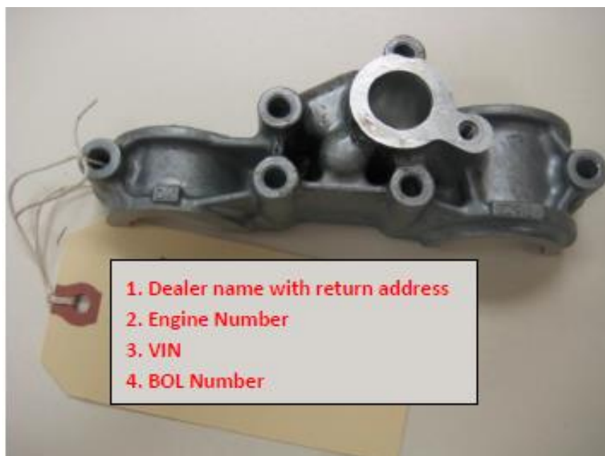
Figure 1 – Front camshaft bearing cap

Maserati Quattroporte and GranTurismo vehicles with wet sump engine, with an engine number prior to 148697, may be affected by two different types of timing variator noise. In the event of a customer complaint of the noise from variator at cold start or when releasing the throttle in above mentioned vehicles, verify the engine number and follow the flow chart shown on following page.