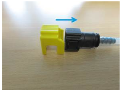
Figure 3. Installation direction of the securing clip.