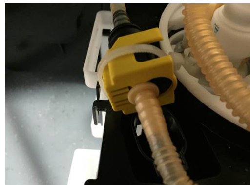
Figure 9. Placement of the fuel line.