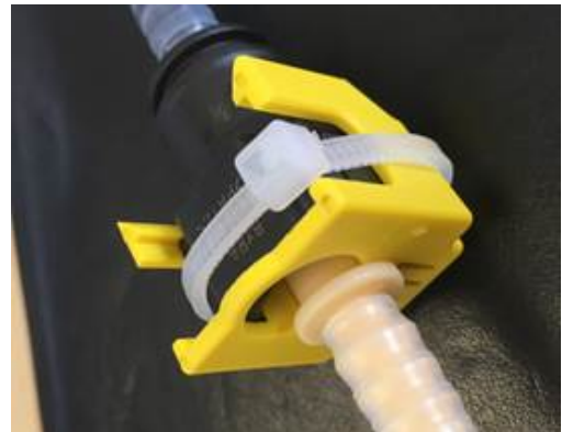
Figure 8. Cable tie installation.