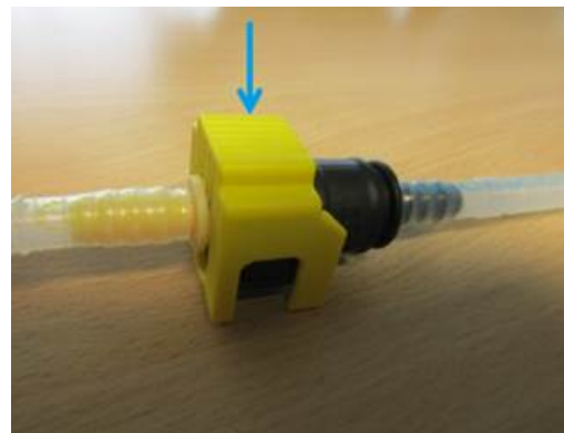
Figure 6. Push the yellow securing clip down.