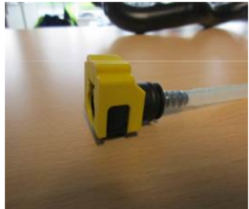
Figure 4. Securing clip correctly installed with the release tabs locked in place.