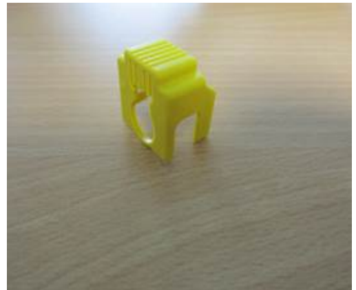
Figure 2. Yellow securing clip.