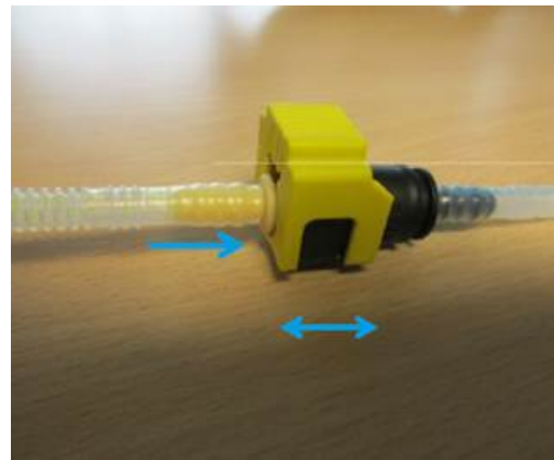
Figure 5. Insert the male end into the black connector.