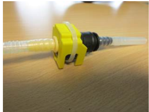
Figure 7. Cable tie installation.