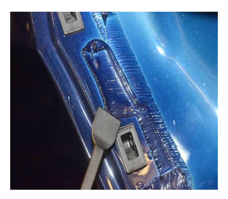
Fig. 3 Removing Sealant