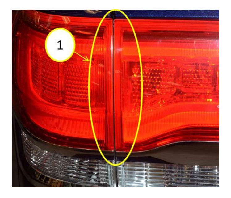
Fig. 1 Too Close Of Gap Clearance

Customers may notice that the left rear tail lamp has too tight of a gap (Fig. 1) compared to the right rear tail lamp (Fig. 2).