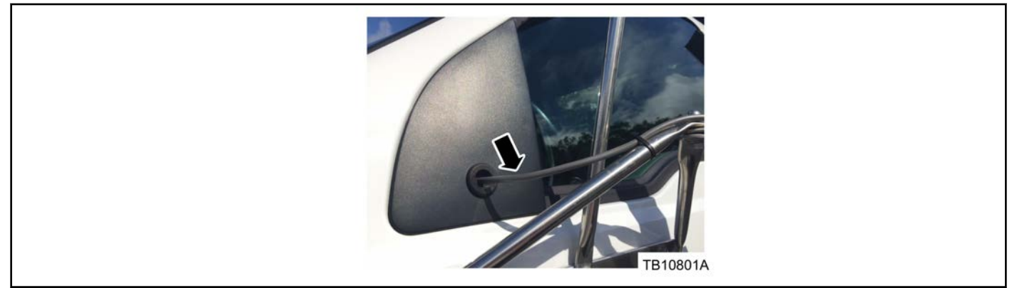
Figure 2 - Article 16-0061

NOTE: The information contained in Technical Service Bulletins is intended for use by trained, professional technicians with the knowledge, tools, and equipment to do the job properly and safely. It informs these technicians of conditions that may occur on some vehicles, or provides information that could assist in proper vehicle service. The procedures should not be performed by "do-it-yourselfers". Do not assume that a condition described affects your car or truck. Contact a Ford, Lincoln, or Mercury dealership to determine whether the bulletin applies to your vehicle. Warranty Policy and Extended Service Plan documentation determine Warranty and/or Extended Service Plan coverage unless stated otherwise in the TSB article. The information in this Technical Service Bulletin (TSB) was current at the time of printing. Ford Motor Company reserves the right to supercede this information with updates. The most recent information is available through Ford Motor Company's on-line technical resources.