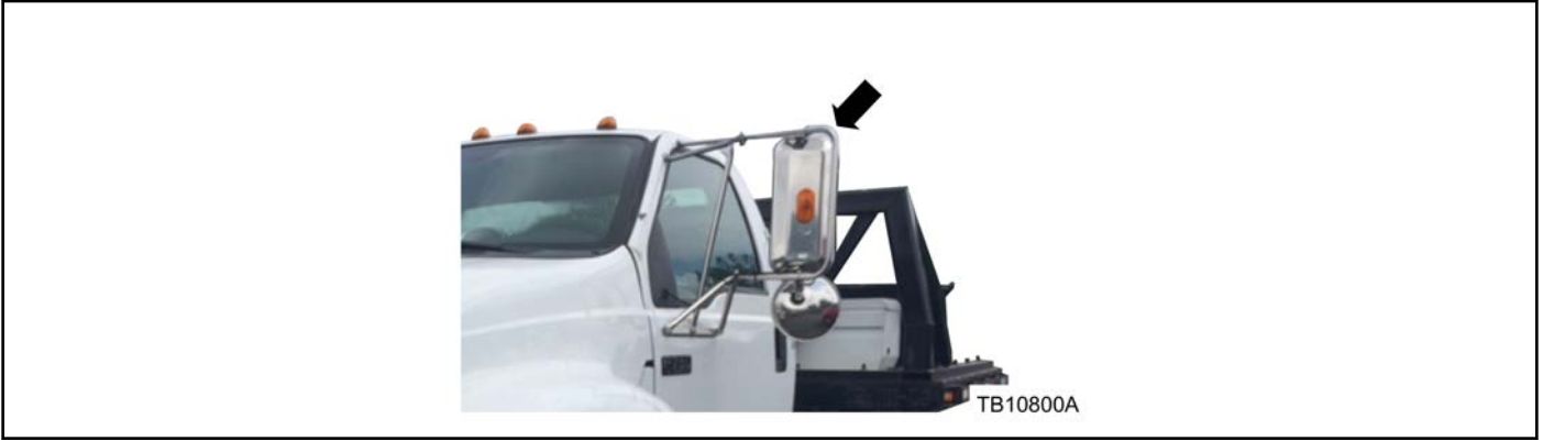
Figure 1 - Article 16-0061

1. Is the vehicle equipped with exterior tubular stainless steel west coast style mirrors? (Figure 1)