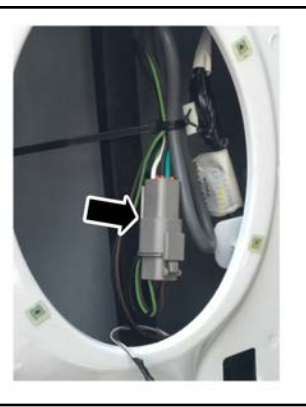
Figure 3 - Article 16-0061