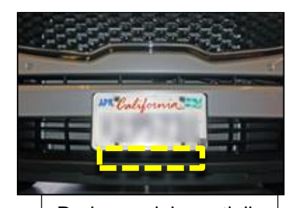
Radar module partially blocked; plate mounted incorrectly

On 2WD vehicles equipped with AEB, the radar sensor is mounted below the front bumper cover. The license plate needs to be positioned to provide an unobstructed "forward view" for the AEB radar module. If the bracket and license plate are mounted incorrectly, the plate may interfere with the AEB sensor and cause the system to not operate correctly. The system may display the "Auto Emergency Braking Disabled Temporarily" message in the instrument cluster center and/or may illuminate the AEB warning light until the condition is corrected.