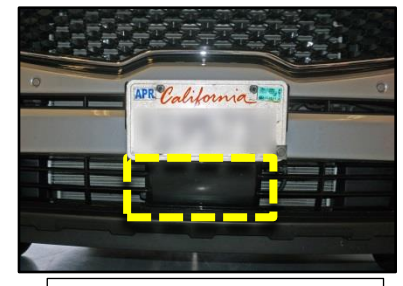
Radar module unobstructed; plate mounted correctly

To position the bracket and plate correctly, align the two guide/locator pins on the back of the bracket with the dimples in the front bumper cover (A) and position the license plate mounting holes in the bracket at the top, as shown (B) below.