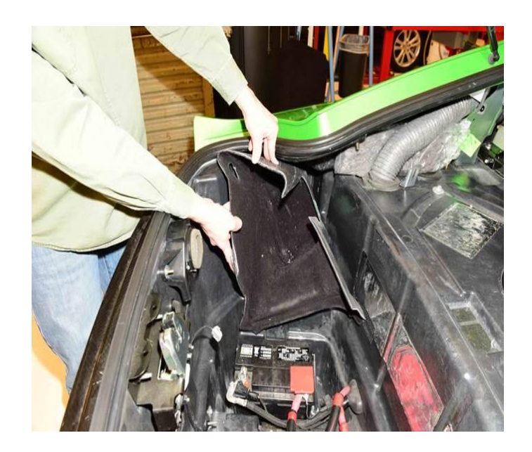
Fig. 6 Carpet Inserts

12. Torque the four main M-8 bolts to 22 N·m (16 Ft·Lbs) (Fig. 7).