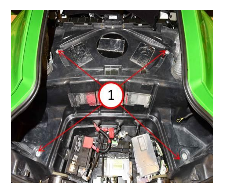
Fig. 7 Trunkpan Bolt Locations

12. Torque the four main M-8 bolts to 22 N·m (16 Ft·Lbs) (Fig. 7).