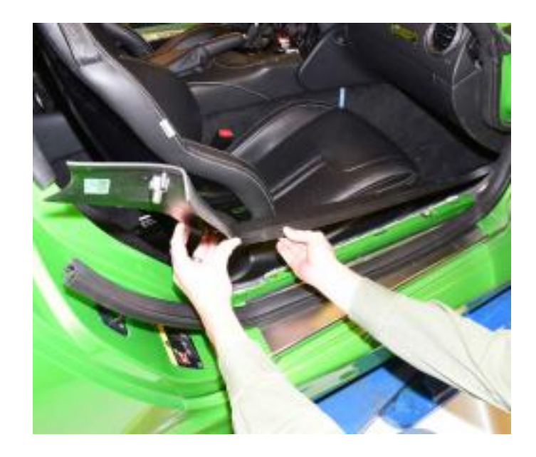
Fig. 5 Cowl Trim Piece