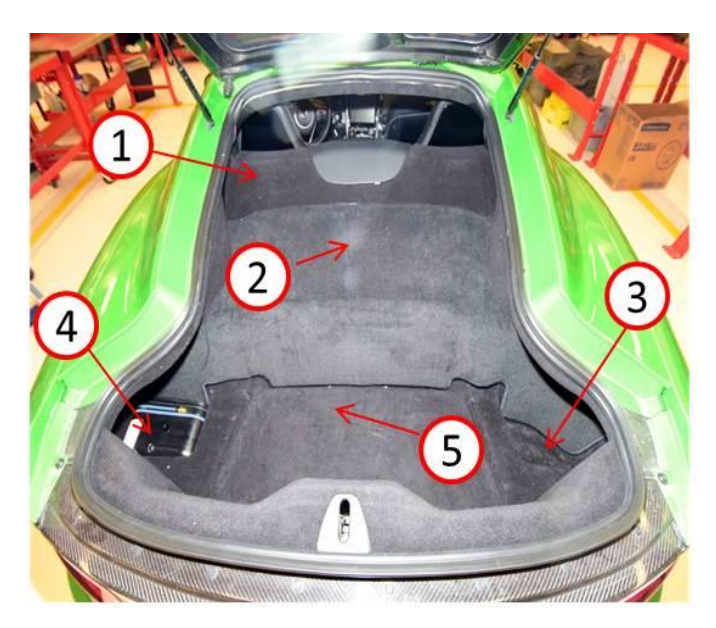
Fig. 1 Component Call-outs