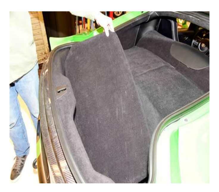
Fig. 2 Trunk Cover

3. Remove the trunk load floor panel (Fig. 2). Refer to the detailed service procedures available in DealerCONNECT> TechCONNECT under: Service Info> 23 - Body> Interior> Panel, Trunk Trim, Rear> Removal.