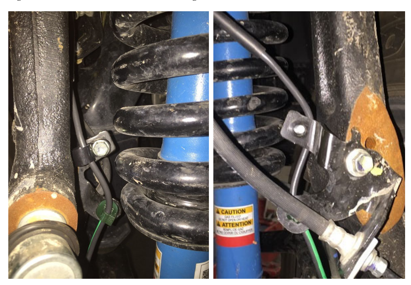
Figure B Rear view

www.procompusa.com 2360 Boswell Road, Chula Vista, CA 91914 Phone: (800) 776-0767 Fax: (619) 216-9404