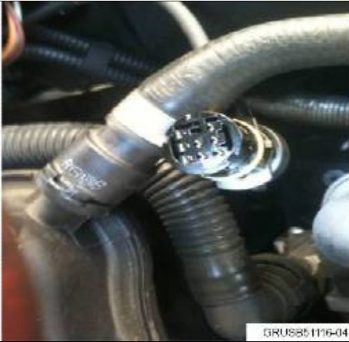
VVT sensor engine harness connectors (X60253)

3. Inspect the DME and DME electrical harness connector.