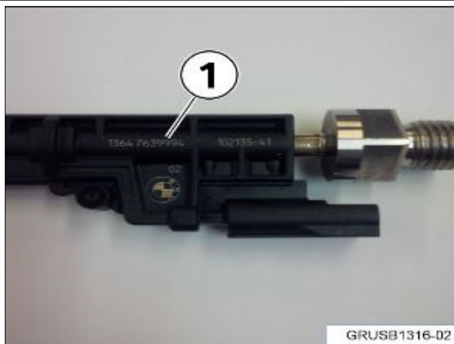
Injector part number location (1).

When the ETK is corrected, this SI B will be updated.