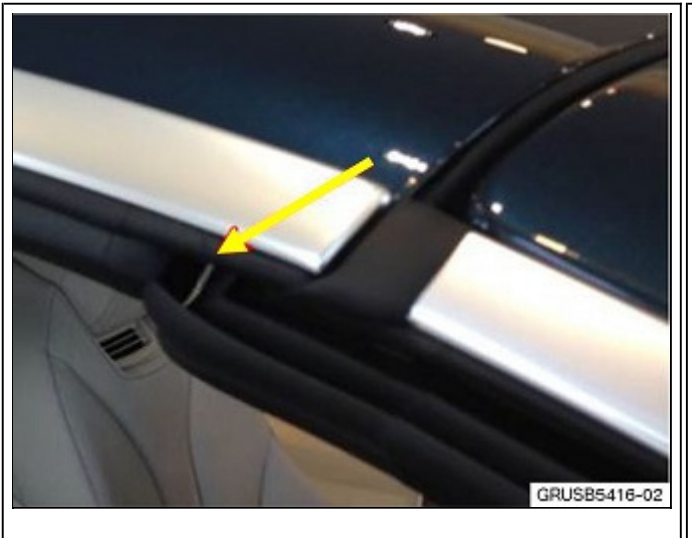
Photo at left shows gap between A-pillar seal and cowl panel seal (outside view).

Photo at left shows gap between A-pillar seal and cowl panel seal (inside view).