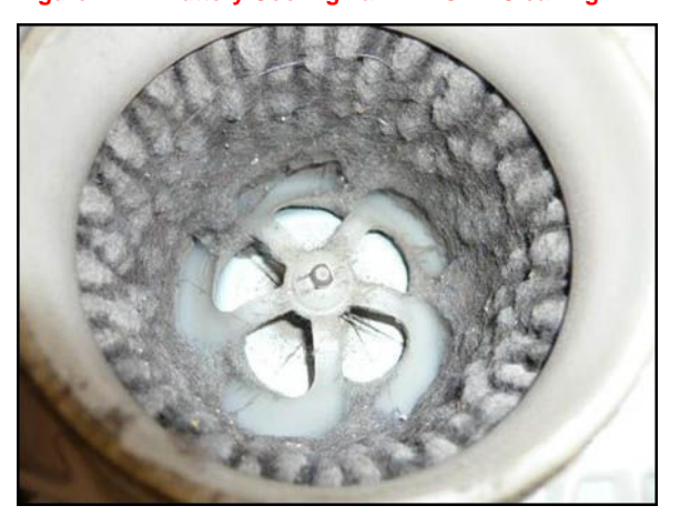
Figure 1. HV Battery Cooling Fan BEFORE Cleaning