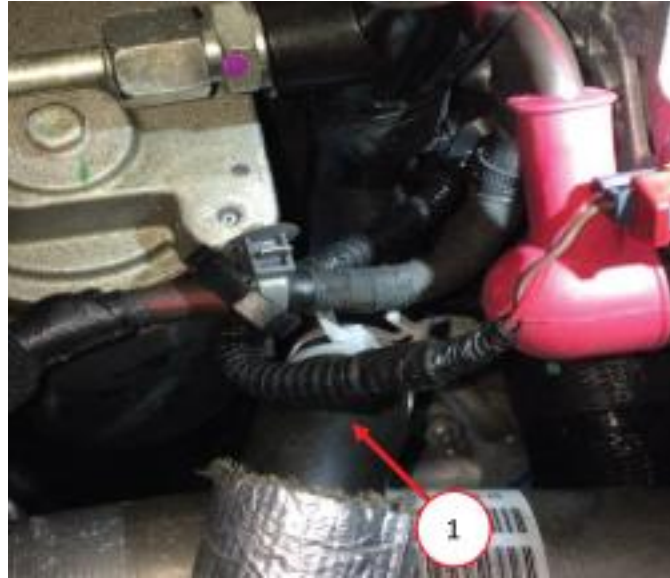
Fig. 3 Reservoir and Return Hoses