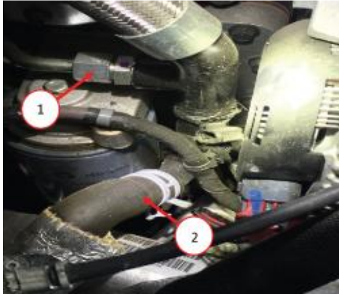
Fig. 6 Return Hoses

19. Remove reservoir return hose and turbo coolant return hose (Fig. 6).