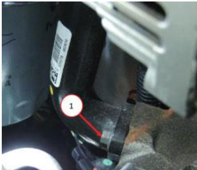
Fig. 7 Coolant Inlet

20. Remove bolt at coolant inlet (Fig. 7).