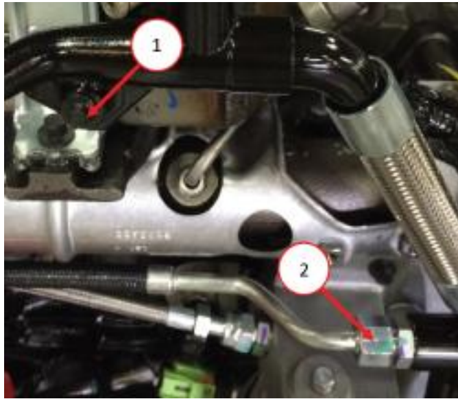
Fig. 2 EGR Cooler-Bolt