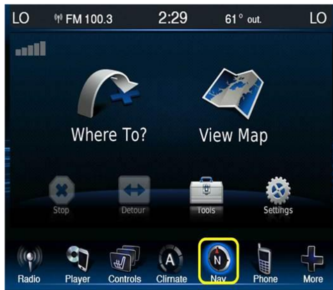
Fig. 8 Update Complete