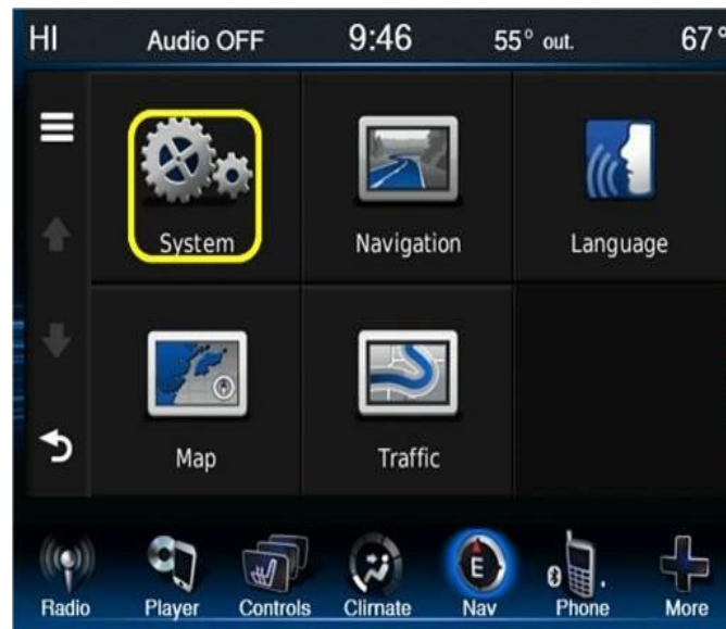
Fig. 5 System Screen Icon