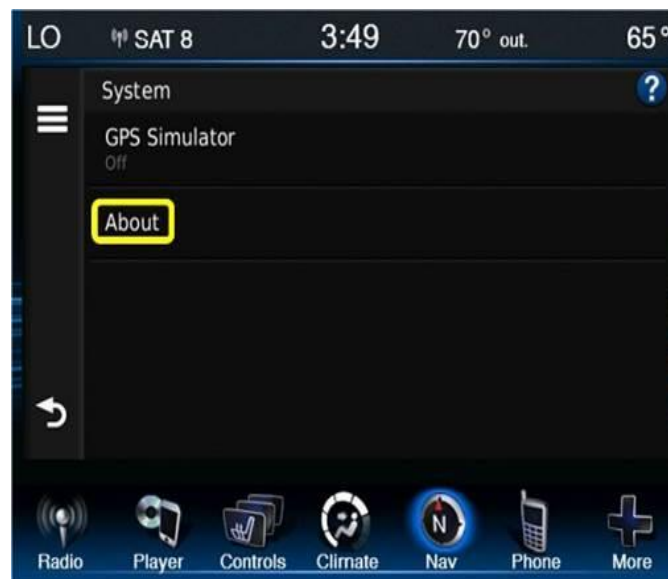
Fig. 6 About Screen Icon