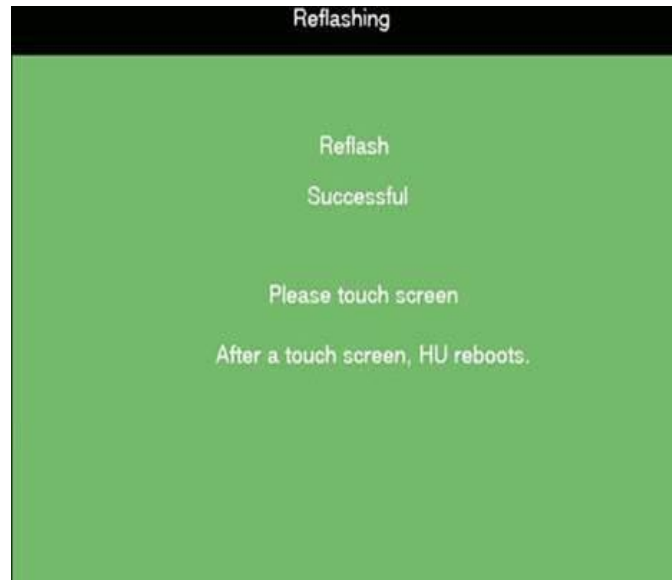
Fig. 2 Touch Screen Instruction