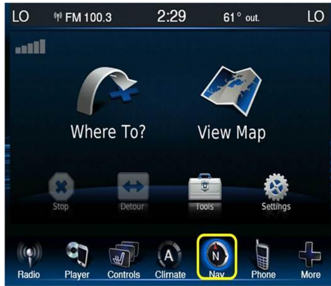
Fig. 3 Nav Screen Icon