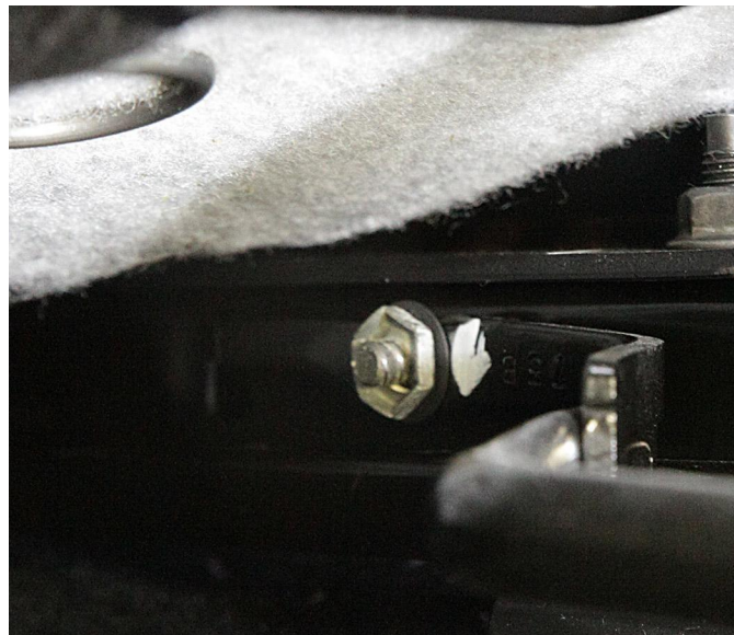
Fig. 3 Speed Nut