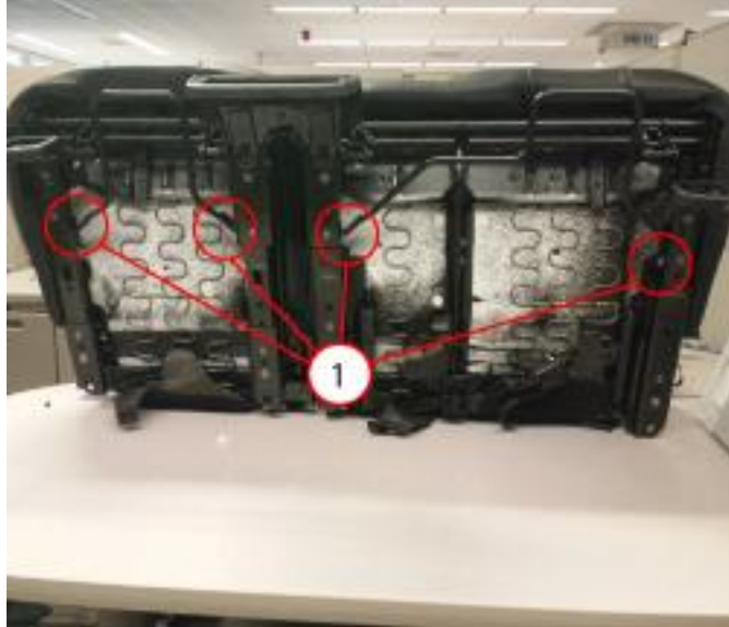
Fig. 1 Speed Nut locations

1 - The Four Seat Track adjustment Bar to Adjustment Track Locations