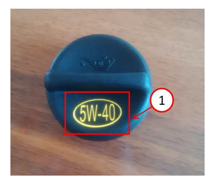
Fig. 3 Cap After Sticker Applied

12. Replace the oil fill cap with the new 5W-40 sticker firmly attached (Fig. 3).